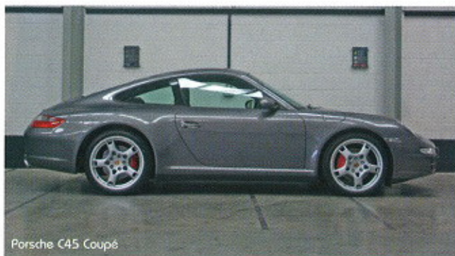
Porsche C4S Coupé