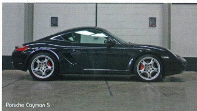
Porsche Cayman S

And, my, what powerhouses some of them are. Divided into six separate groups, P1's line-up is fairly diverse, and thanks to its established